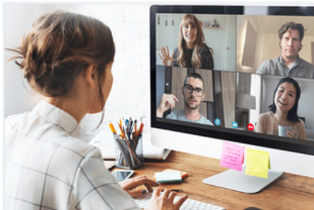
Foundation Live Online Course