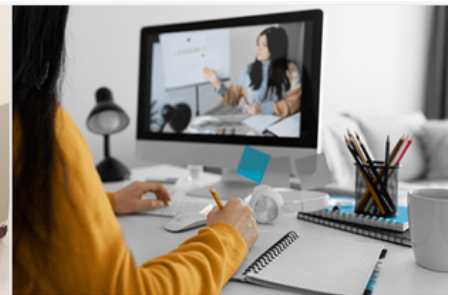
Foundation Blended Learning Program

Our PPP Learning Programs are designed for executive decision-makers, senior government employees and private sector practitioners involved with infrastructure and service delivery. We also recommend them to professionals in finance, economics, law, procurement, environmental protection, risk, and engineering.