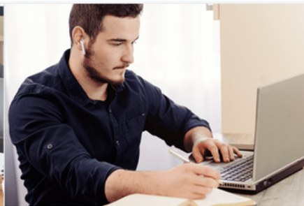
Foundation Self-Paced Course